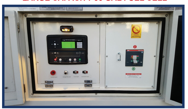
REAR CONTROL PANEL WITH MLCB