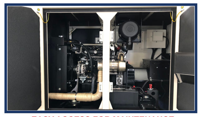
EASY ACCESS FOR MAINTENANCE