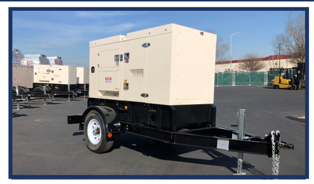
LARGE CAPACITY 90 GAL FUEL CELL

UQ45H-T4f: Standby Rating: 45kVA / 37.5kW Prime Rating: 43kVA / 36kW