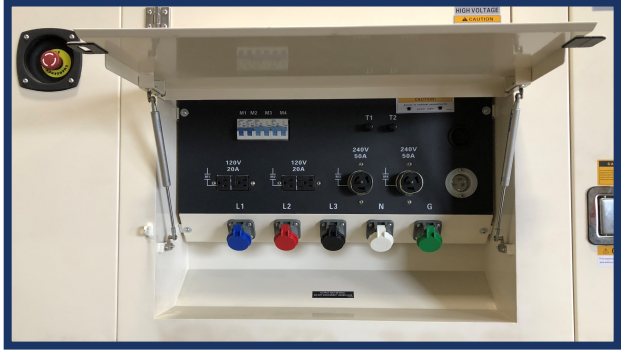
CUSTOMER CONNECTION PANEL